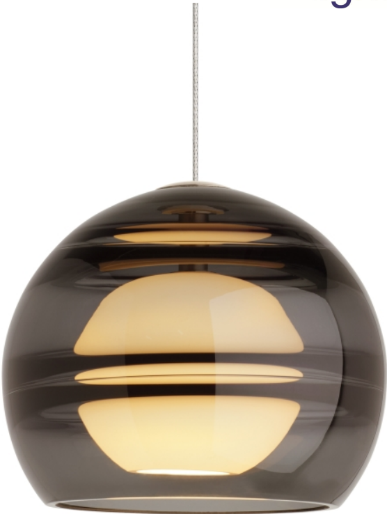
Transparent Smoke / Satin Nickel