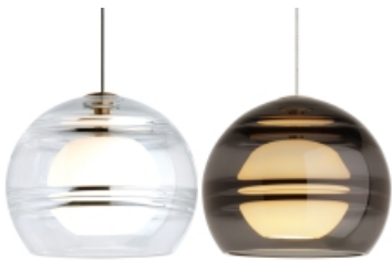
Clear / Aged Brass