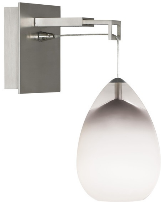
Satin Nickel shown with Alina (not included)