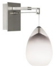
Satin Nickel shown with Alina (not included)

The integrated telescoping arm accommodates any pendant under 7.5 inches in diameter. The Ensu wall canopy can mount to either a 4" square electrical box with round plaster ring or an octagonal electrical box (not included). Includes low-voltage electronic transformer. Halogen version dimmable with a standard incandescent dimmer. LED version dimmable with a low-voltage electronic dimmer.