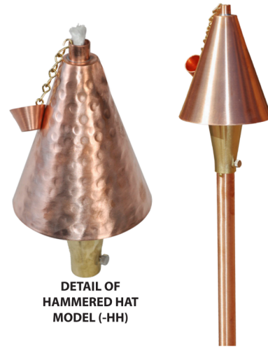
DETAIL OF HAMMERED HAT MODEL (-HH)

Optional finishes available in Acid Rust (-CAR), Acid Verde (-CAV), Black Acid Treatment (-BAT)