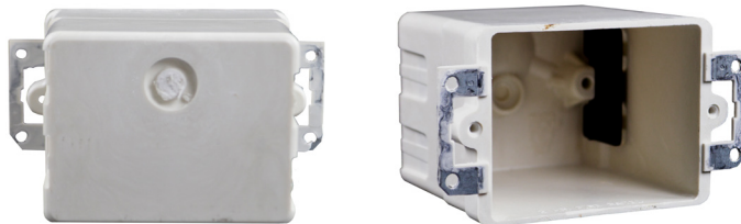
FA-SG-BOX Single Gang Box