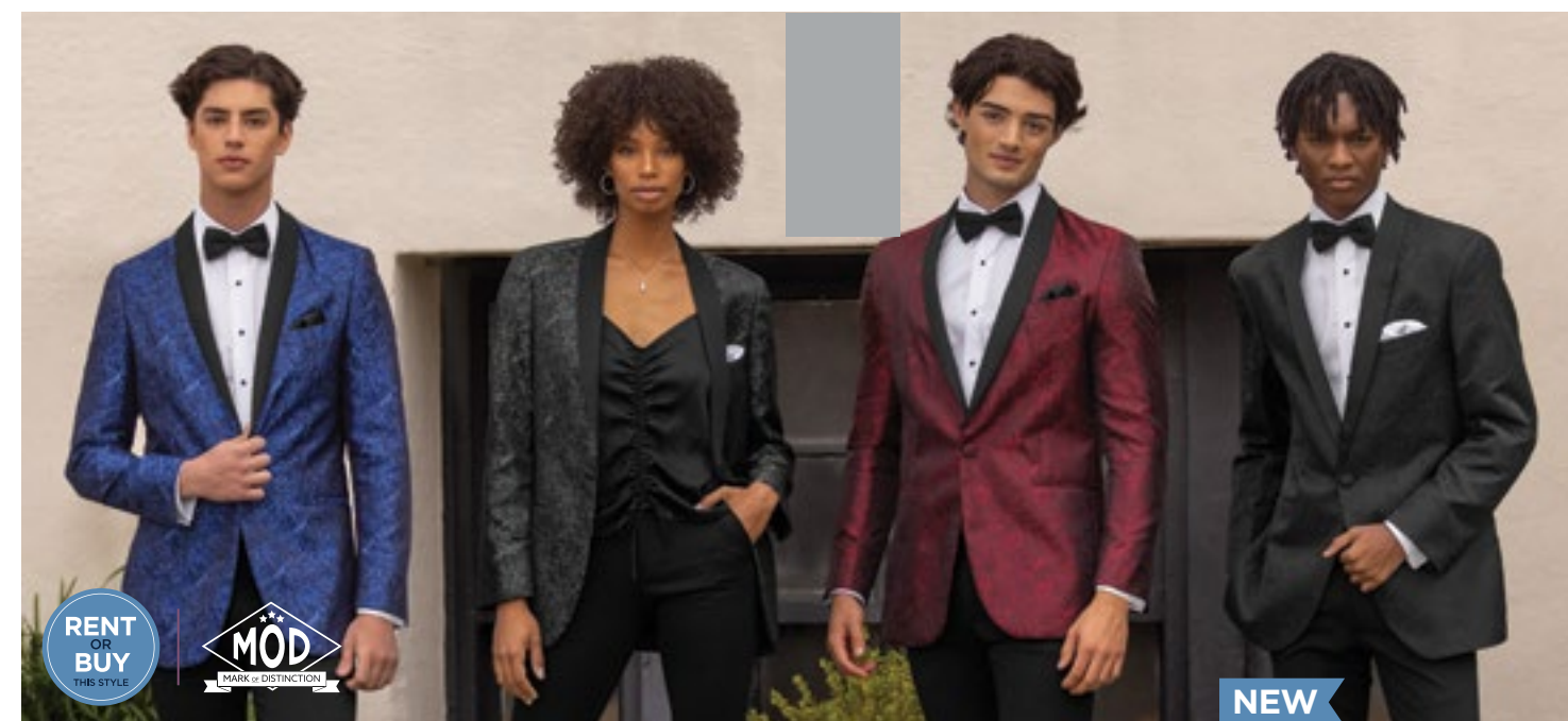
MOD MARK OF DISTINCTION RENT OR BUY THIS STYLE Cobalt Blue Aries Paisley Slim Fit Tuxedo by Mark of Distinction / 132