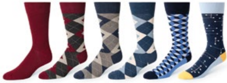
FOR PURCHASE ONLY Patterned & Colorful Socks / XSWI, XPWG, XPNG, XPHN, XPBNA, XPLNA Other colors are available; choose from 23 styles total