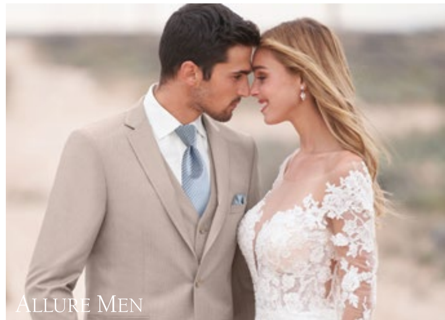
ALLURE MEN Sand Brunswick Ultra Slim Fit Suit by Allure Men / 202