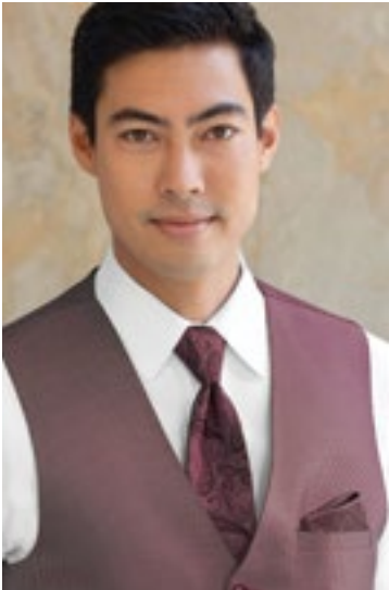
Foundation Fullback Vests, Ties & Pocket Squares available in 6 colors