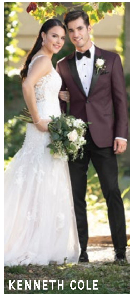
KENNETH COLE Burgundy Empire Ultra Slim Fit Tuxedo by Kenneth Cole / 201