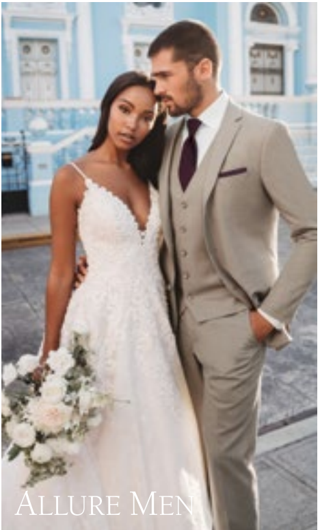
A L L U R E M E N Sand Brunswick Ultra Slim Fit Suit by Allure Men / 202