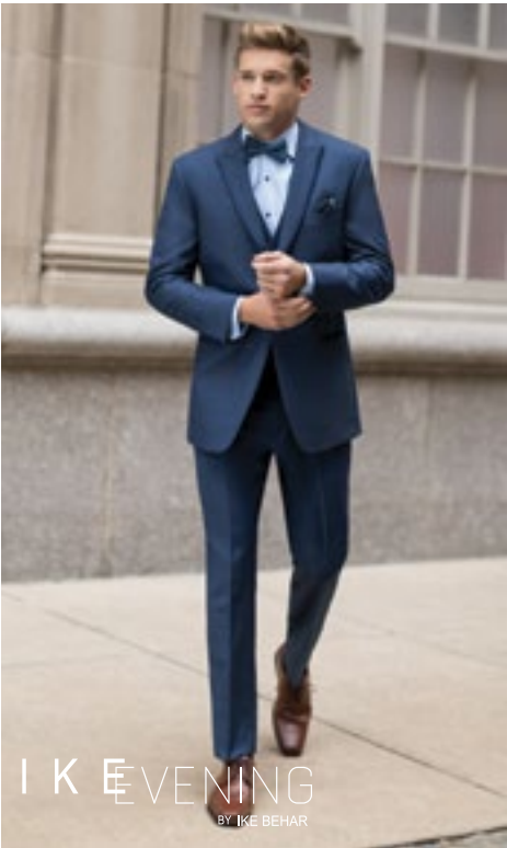
I K E V E N I N G Indigo Blue Lane Ultra Slim Fit Tuxedo by Ike Behar / 221