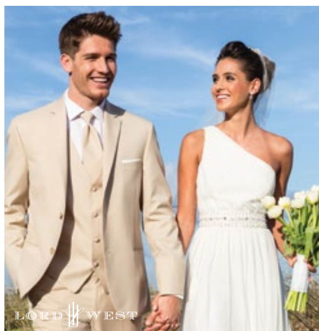
LORD WEST Tan Havana Slim Fit Suit by Lord West / 252