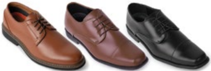
RENT OR BUY THESE STYLES Formal Shoes / Chestnut Plain Toe Oxford Shoe, Cognac Oxford Shoe & Black Oxford Shoe Three additional styles are also available for rental; see the JFW Accessory Collection catalog