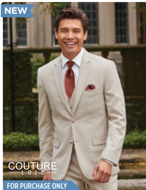
NEW COUTURE 1910 FOR PURCHASE ONLY Tan Slim Fit Suit by Couture 1910 / NHTC