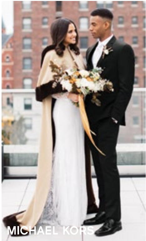
MICHAEL KORS Black Sterling Slim Fit Wedding Suit by Michael Kors / 472

We are able to fit everyone in your wedding party with sizes ranging from a Boys' size 3 to a Men's size 66 Long. You can count on your Jim's Formal Wear Retailer for expert fitting advice.