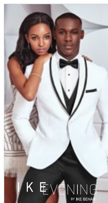
IKE BEHAVIOR Waverly Ultra Slim Fit Tuxedo by Ike Behar / 751