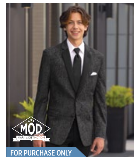
MOD MARK OF DISTINCTION FOR PURCHASE ONLY Anaconda Snakeskin Slim Fit Tuxedo by Mark of Distinction / N8AC

Break from tradition with these fashion-forward suit and tuxedo styles.