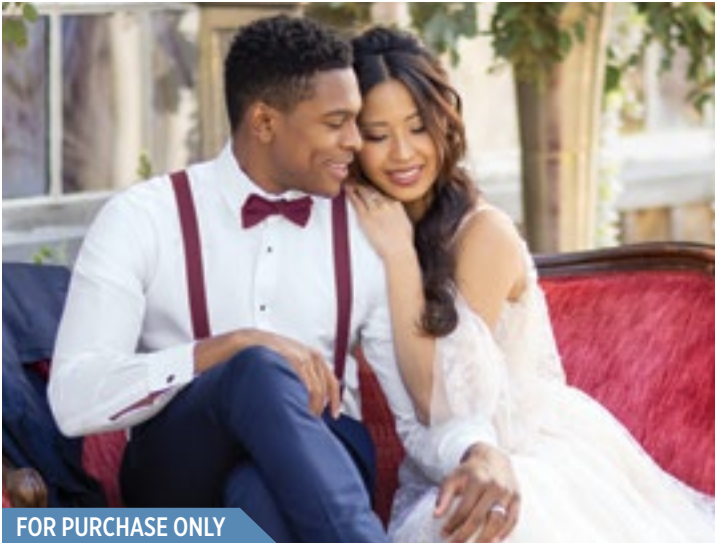
FOR PURCHASE ONLY Novelty Suspenders available in 23 colors