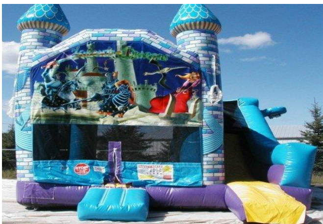
Climb & Slide, Twister & Basketball Hoop, 16x16 Wacky & Knights Dragons