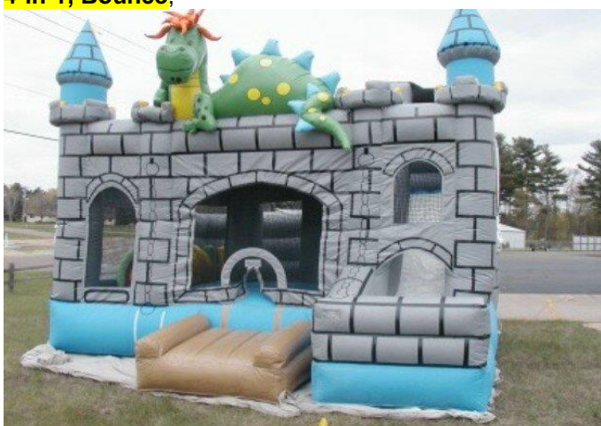
Obstacle, Climb & Slide' 16x16, Shark/Dolphin, Fire Dog Belly