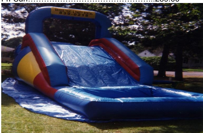
Rainbow Slide, Wet or Dry