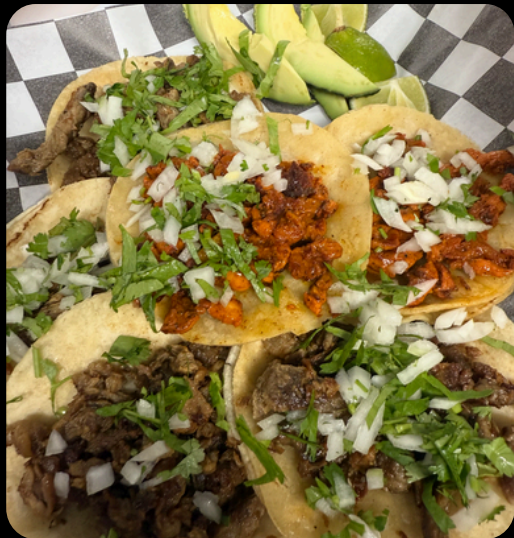
PASTOR, ASADA, POLLO