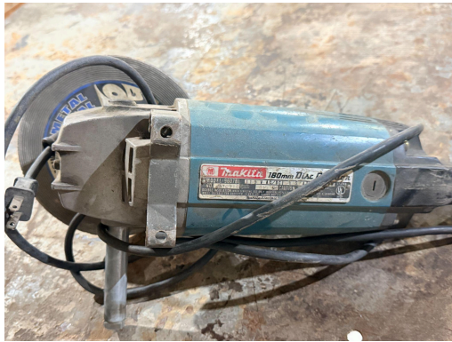
Makita disc grinder $130