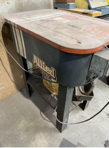
Parts cleaner $50