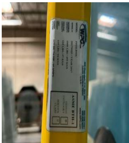
Vacuum cup lifter small $5000