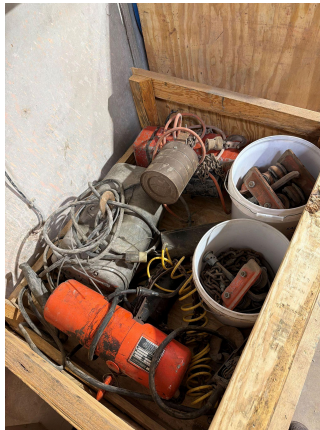
$420 3 hoist as is with parts for beam support.