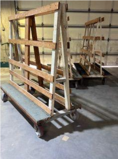
Large carts • 12 @ 60t x 72l x 36w $150 each