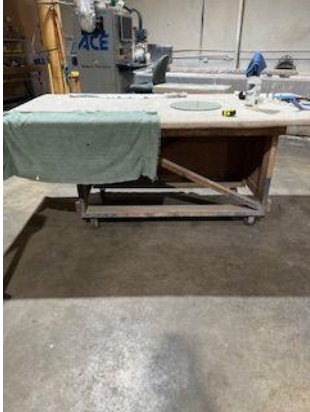
Large carpeted roll table 48" x 96" Tape measure and towels included!