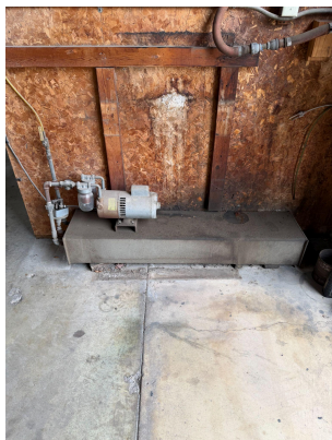
Vacuum pump and chamber $400