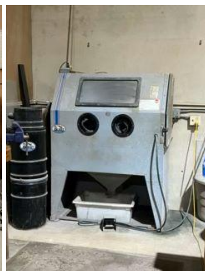
Sandblasters (left) Large $2000 (right) Small $1000