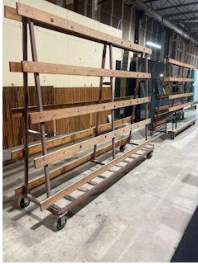
Ex-large stock carts • 2 @ 72t x 108l x 28w $150 each