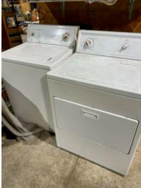
Washer and Dryer (free)