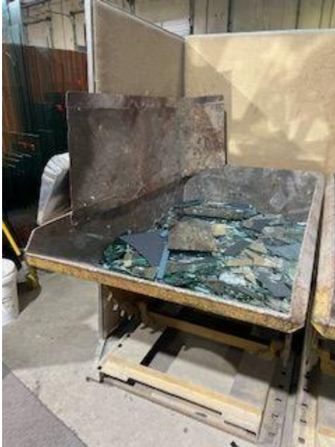
Hopper with splash guard $350

Carts have all metal frames and two caster wheels • Large cart with handle 1 @ 60t x 96l x 48w $250