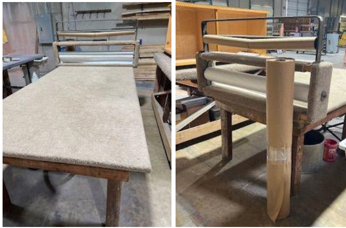
Carpeted wrap table with 2- 48" material holders and 1 roll of paper. 48" x 96"