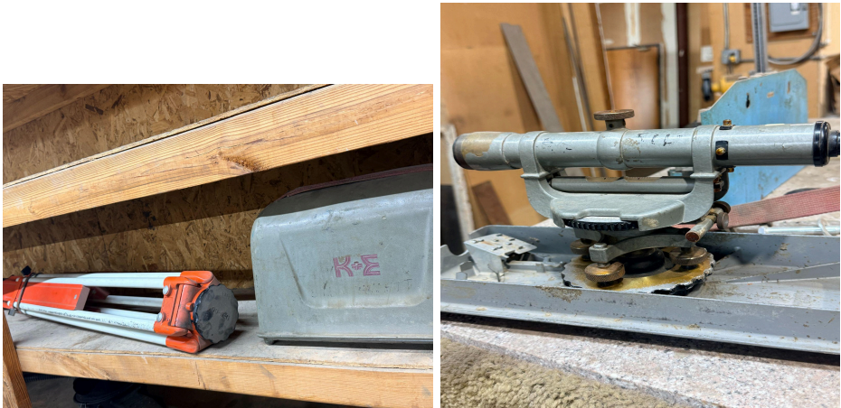
Keuffel & Esser surveyor transit level and survey tripod $200