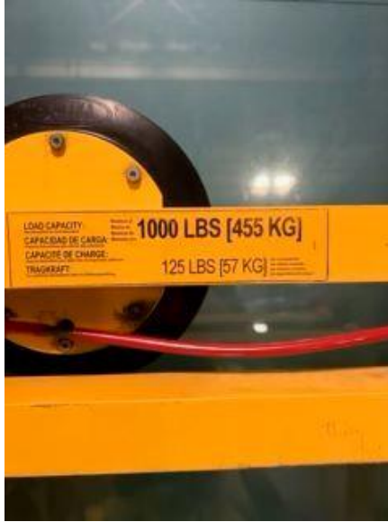
Vacuum cup lifter large $6000