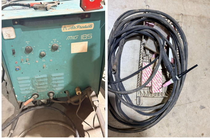
Welder $ 1100 MIG AND TIG ATTACHMENT