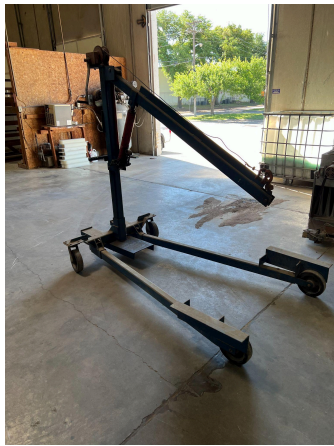
Cherry picker / engine hoist $100