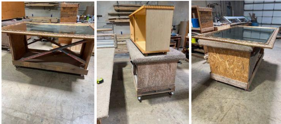
Carpeted roll tables= 2 - 40" x 84" both with two locking caster and two stationary wheels. Mirror and credenza not included