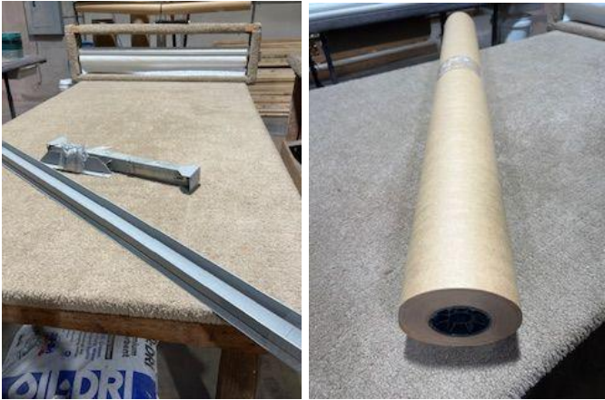
Metal material roll holder= 60" with 1 roll