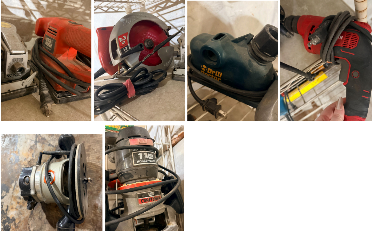
Tools lot $300