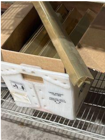
Brass table connectors