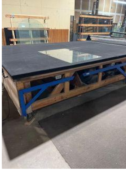
Break out table with breaker bars and air float. With 5 120v outlets. 9' x 11'10" $2000