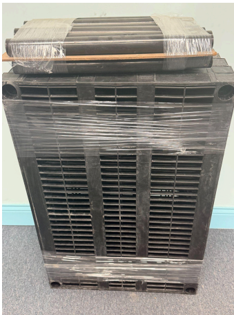
Set of plastic shelf units