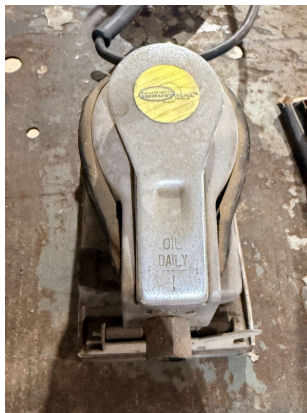
Orbital sander $80