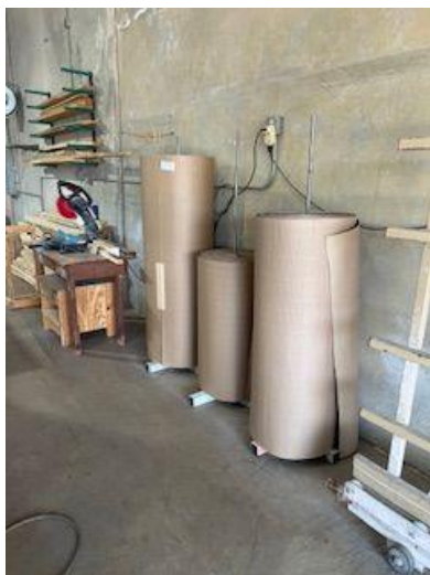
36" 48" and 60" Barley used $120 and the rack that it's on