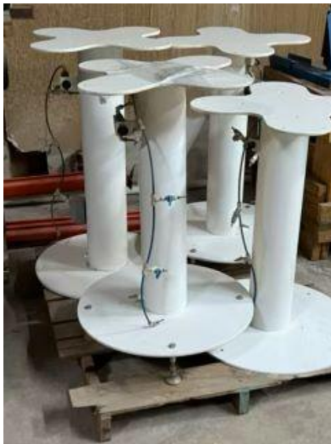
Vacuum stands $300