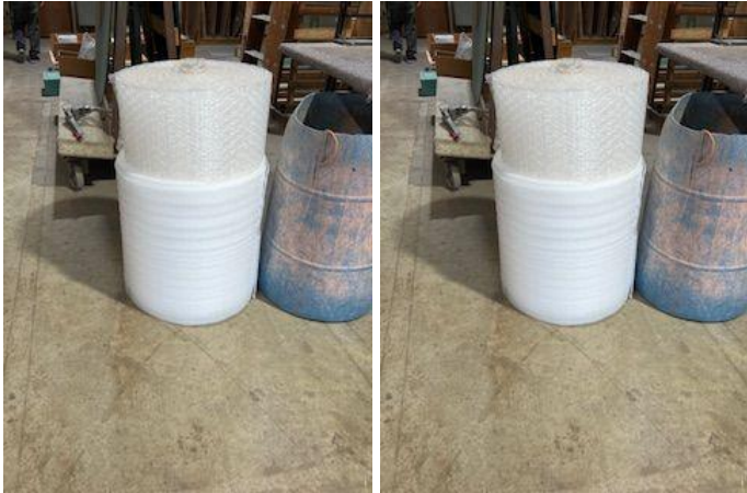
2 full rolls of foam and one about 3/8 used $100

1/2" 4'x8' eps eifs foam 2 packs of 40 and 10 loose $4 a unit $240 total