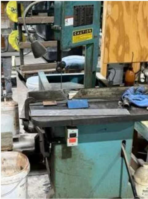
Roll-in saw $600