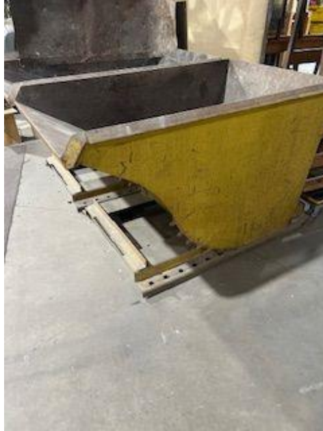
Hopper all 6,000 pound max capacity • 2 @ $300 each