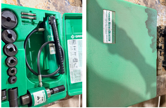
Greenlee 7646 11-Ton Hydraulic Knockout Driver with Hand Pump $950