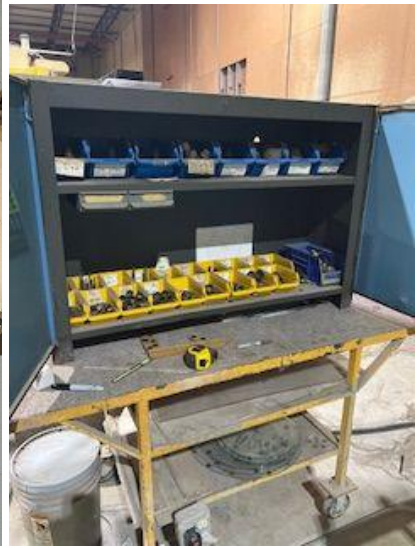
Core drill $15,000 • Hole drill and drill bits with cart and table