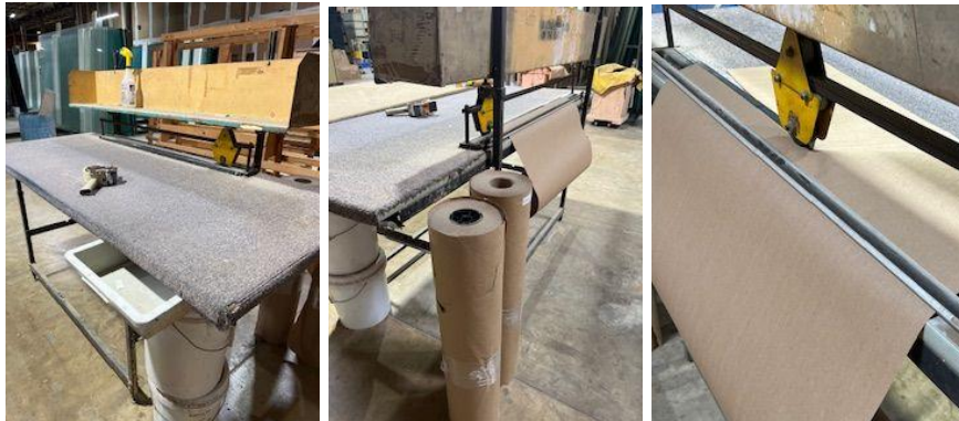
Wrap table with paper dispenser 36" and cutter with two extra rolls.