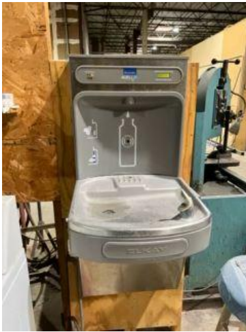
Water fountain • $500