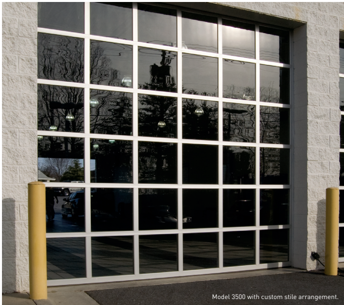
Model 3500 with custom stile arrangement.

Amarr's aluminum doors are constructed of 2" thick extruded aluminum rails and stiles and can be fitted with solid aluminum panels or a variety of full-view glass options. Perfect for automotive showrooms and repair centers, service stations, car washes, fire houses, restaurants, and sports complexes; our aluminum doors create a clean style for any facility. These doors can be mounted stationary or operative as a stylish alternative for all fresco situations.