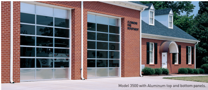
Model 3500 with Aluminum top and bottom panels.

The ClearView Aluminum Strut System provides added strength and durability to larger Model 3550 door sizes up to 24' 2", without restricting the viewing area.