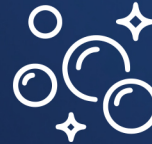
BIO-SURE PLUS™ Filter

Reduces dissolved solids, pharmaceuticals, and metals.