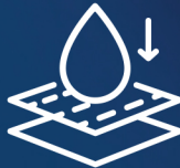
Reverse Osmosis Membrane

Reduces chlorine, chemicals, and pesticides.