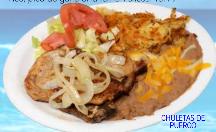
CHULETAS DE PUERCO

Open faced corn tortillas with boneless pork meat marinated in adovada sauce. Topped with lettuce and avocado slices, served with beans, rice, pico de gallo and lemon slices. 15.99