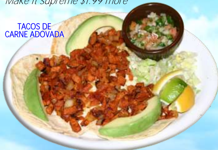
TACOS DE CARNE ADOVADA

A golden sopapilla shell filled with beans and choice of ground beef or chicken, smothered in green chile and topped with lettuce, cheese and tomatoes. Served with beans and rice. 10.49 Substitute carnitas or shredded beef $3.00 Substitute grilled chicken or steak $4.00 Make it supreme $1.99 more