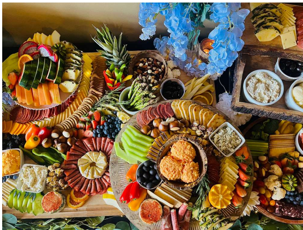
Spectacular Charcuterie Display! (See page 6 for details and pricing)

Check out our reviews on Google, The Knot, Wedding Wire, Facebook, and our website!