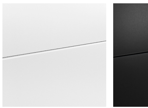
Actual paint colors may vary from samples shown.