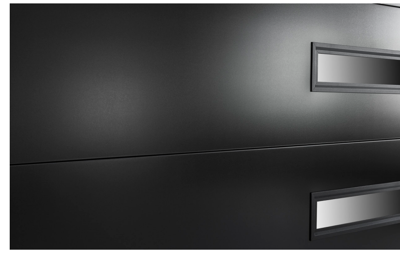
{\sf EOS}\, in\, {\sf Black}\, with\, {\sf Black}\, frame\, {\sf SlimLine}\, windows

Smooth as ice. The Amarr EOS smooth flush garage doors feature a sleek, minimalist design with a flat, uninterrupted surface that enhances the aesthetic of any home. The combination of heavy-duty steel, polyurethane insulation, and a true thermal break offers both energy efficiency and style. This premium, high-quality door seamlessly integrates with modern architectural styles, adding a touch of sophistication to your home's curb appeal.