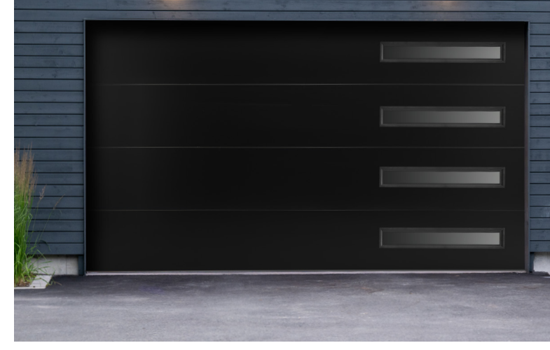
EOS in Black with Black frame SlimLine windows