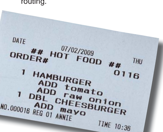
Kitchen requisition printed by the SPS-530 80mm receipt printer shown 75% actual size.

SPS-500 series ECRs can be connected in a fast and reliable Ethernet-style network. Networking supports report data consolidation, ECR programming, payment authorizations, polling, plus printer and video requisition routing.