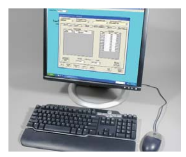
Polling and Inventory Software

Enjoy the advantages of scanning – price control, item movement reporting and labor savings.