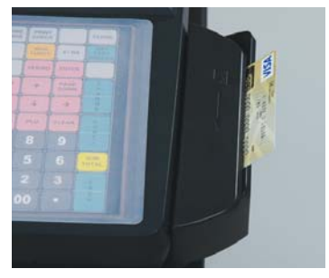
Magnetic Card Reader

Enhance the powerful SPS-500 series hybrid ECR with optional peripherals to complete a sophisticated system configuration.