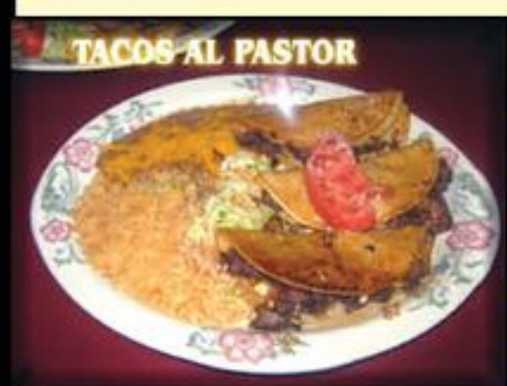
TACOS AL PASTOR