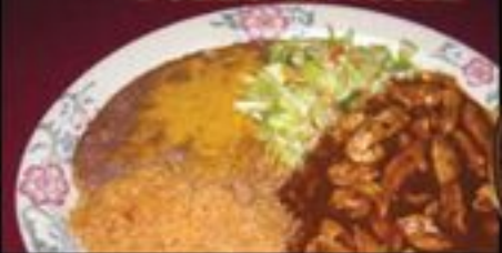
POLLO EN MOLE