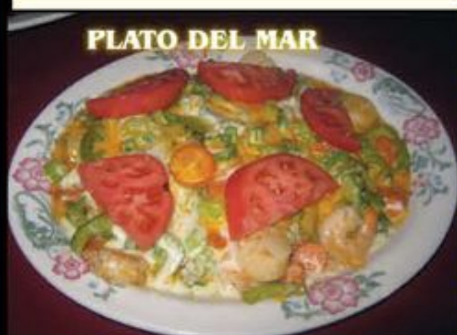
PLATO DEL MAR