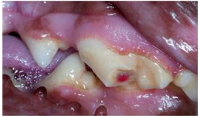
Chipped and fractured teeth in a dog.