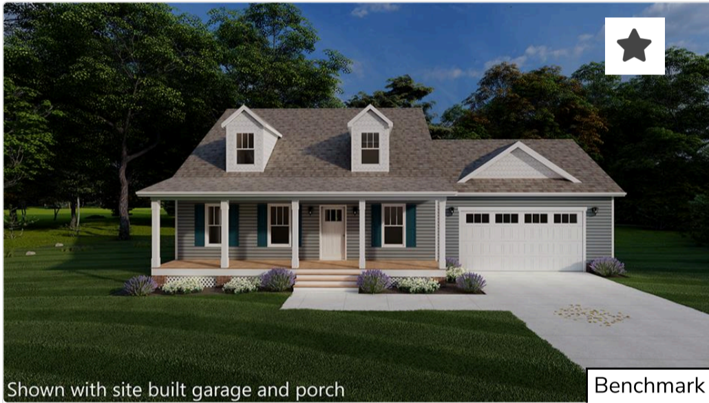
Shown with site built garage and porch