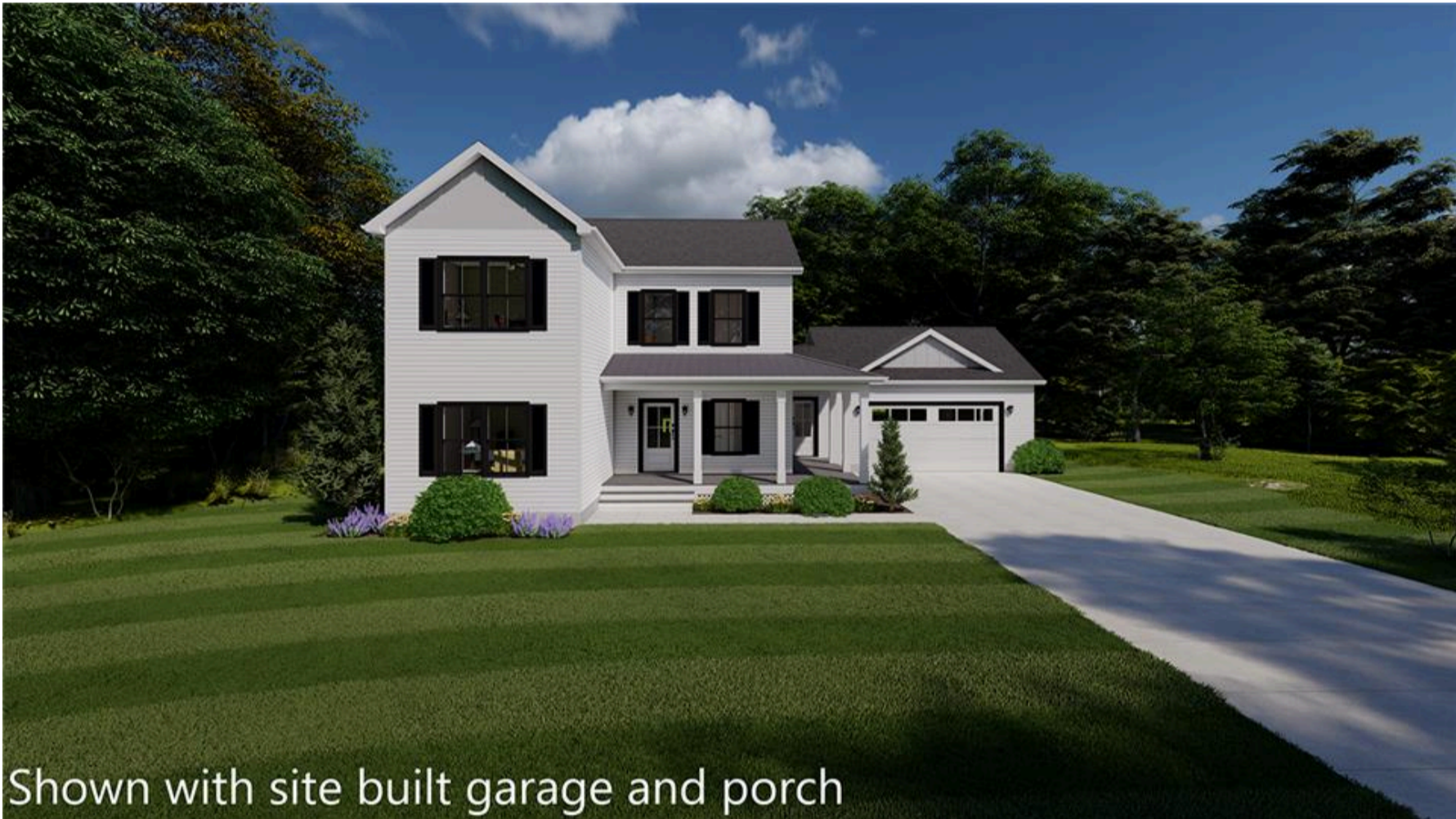
Shown with site built garage and porch