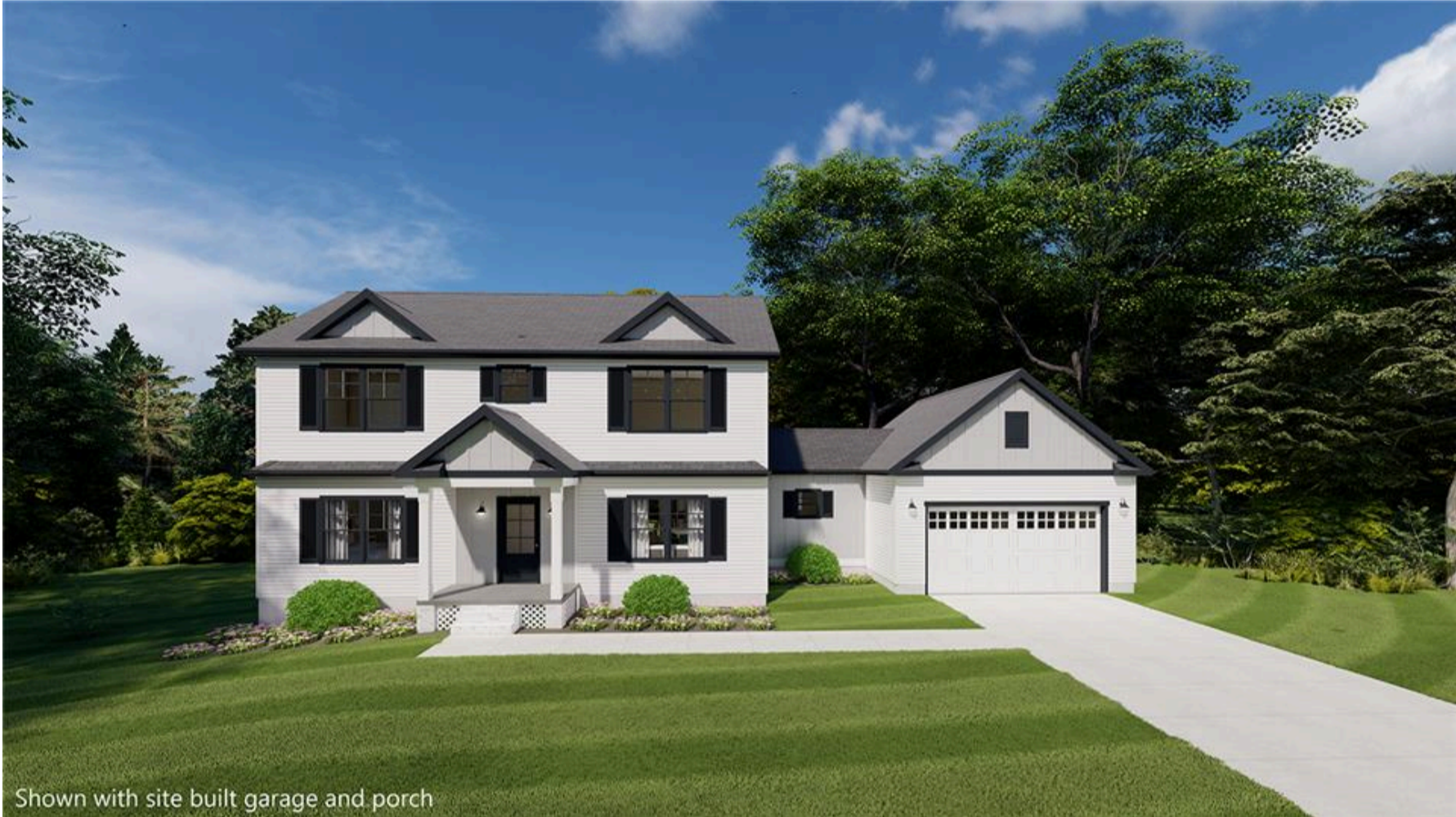
Shown with site built garage and porch