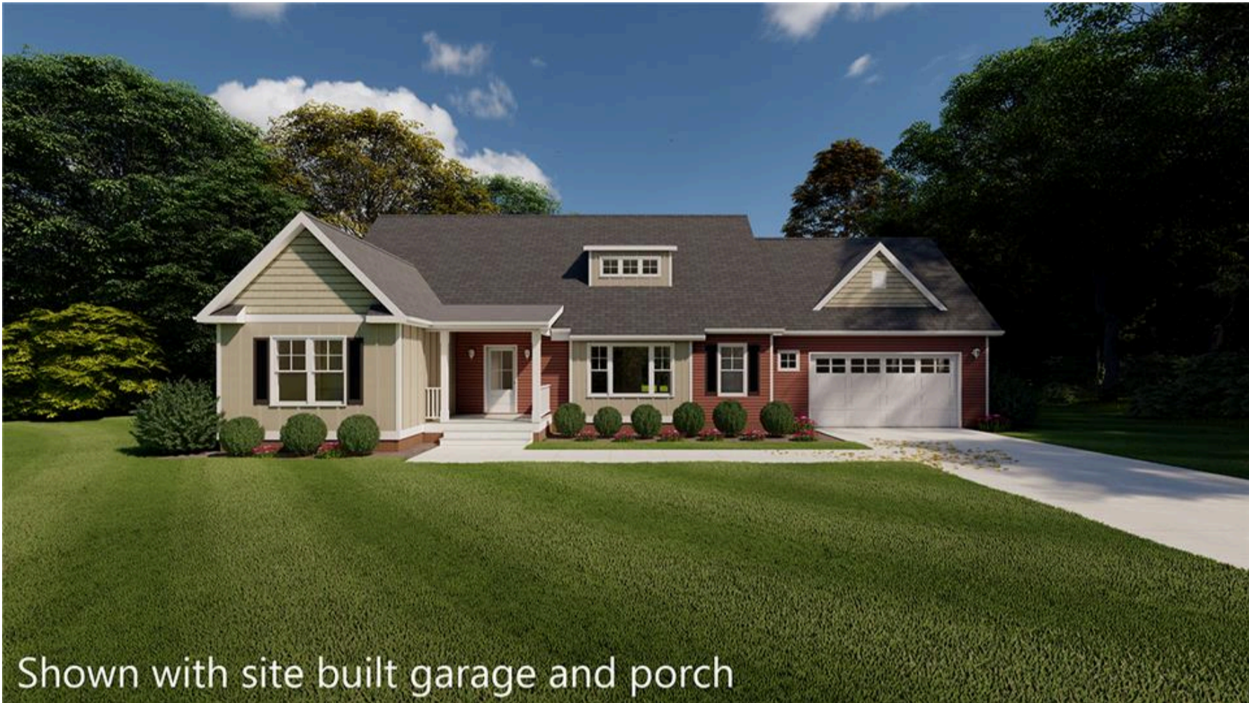
Shown with site built garage and porch