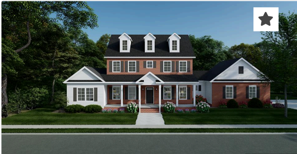
Shown with site built garage, porch with optional high pitch roof and dormers