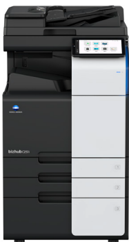
bizhub i-Series C251i