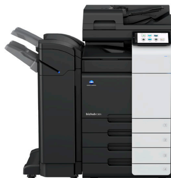
bizhub i-Series C301i