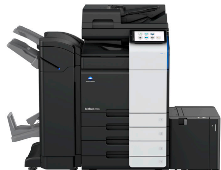
bizhub i-Series C361i