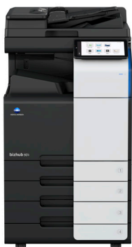
bizhub i-Series 301i