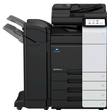
bizhub i-Series 361i