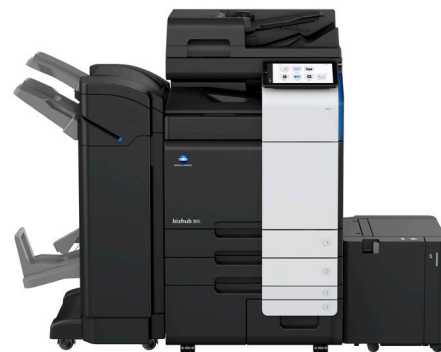
bizhub i-Series 361i