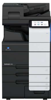
bizhub i-Series C451i