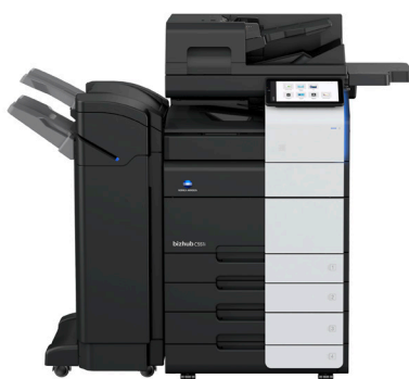
bizhub i-Series C551i