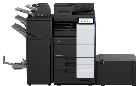
bizhub i-Series C651i