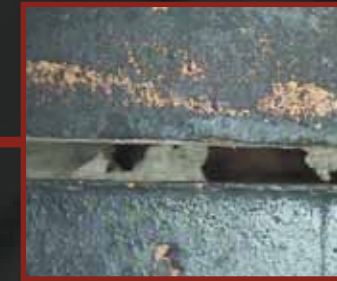
Gaps between Flue Tiles