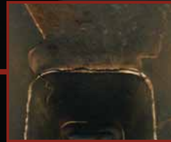
Cracked Flue Tiles