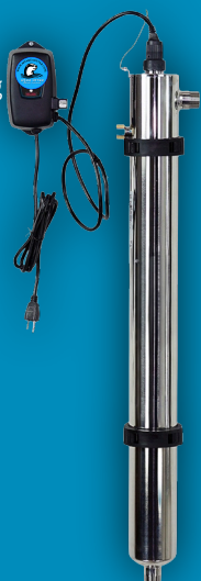
21 gpm (79 lpm) 4.8 m3/hr

Port Size: 3/4" MNPT Reactor Dimensions: 2.5" x 35.2" (6.4 x 89.5cm) Shipping Weight: 15.0 lbs (.8 kg) Lamp (Watts): 39 Power (Watts): 49 Max Current (Amps): 1