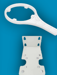
Wrench & Wall Bracket