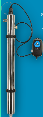
11 gpm (41 lpm) 2.5 m3/hr

Aqua Otter's Whole-House UV Water Treatment System provides an added layer of protection by using ultraviolet light to kill harmful microorganisms that may be present in your water. As water flows through the UV chamber, the light disrupts the DNA of bacteria, viruses, and other pathogens, preventing them from reproducing and causing illness—without adding chemicals or changing the taste of your water. We offer two sizes, 11 GPM and 21 GPM, to ensure proper flow and effective treatment for households of all sizes, giving your family safe, clean water at every tap.