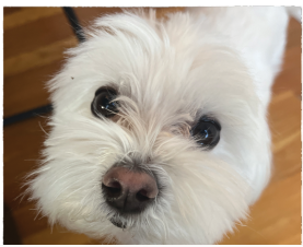
Tochi, the office mascot.