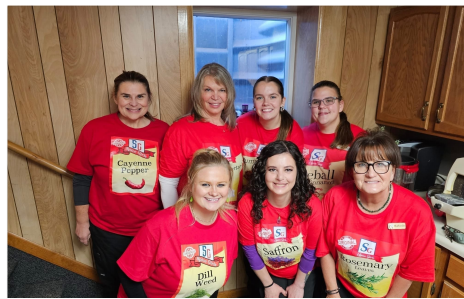
Our fearless Hygiene team (missing one).

So trust us, we are doing our best to accommodate your needs! That’s always our goal!