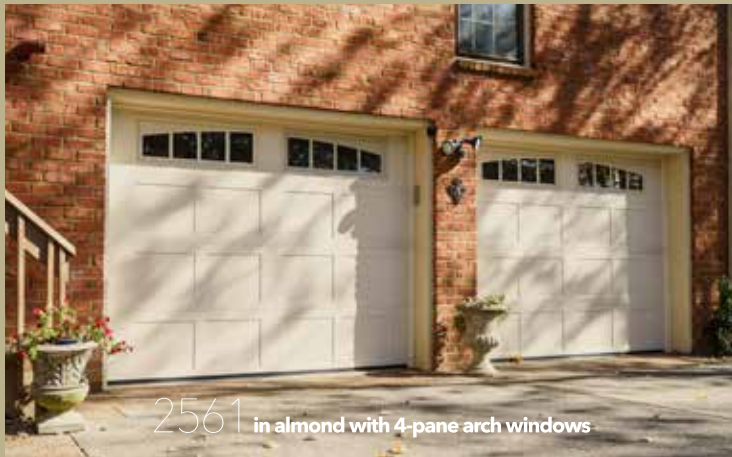
2561 in almond with 4-pane arch windows