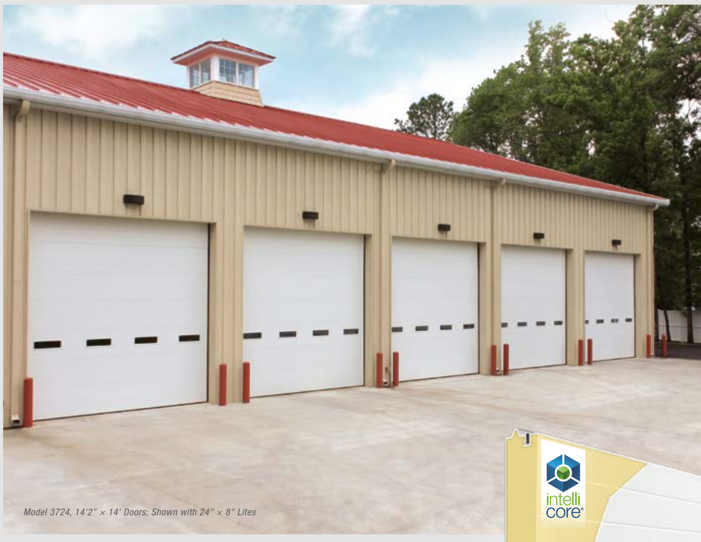
Model 3724, 14'2" x 14' Doors; Shown with 24" x 8" Lites