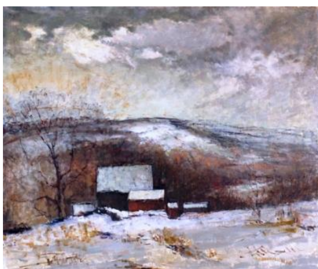
Snow Scene by Gershon Camassar