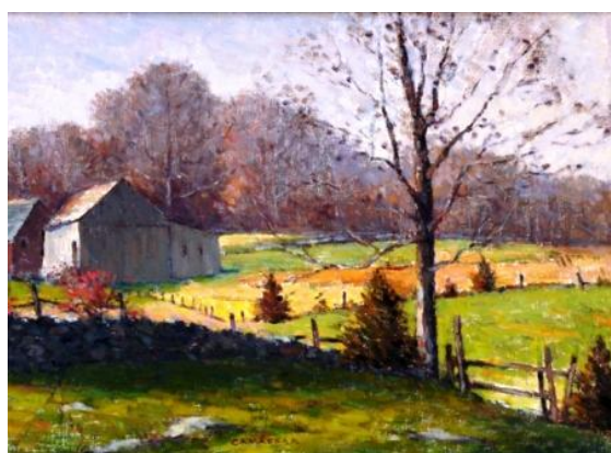
"Afternoon, No. Stonington", oil on board, 1970s