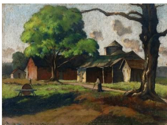
"Old Farm with Grind Stone", pastel, 1954