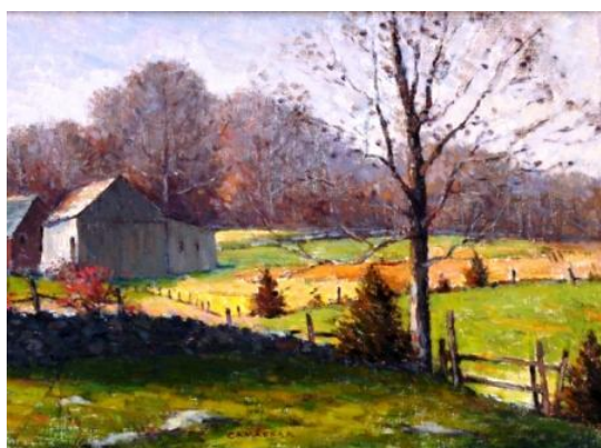
Afternoon, North Stonington , by Gershon Camassar

If a customer slips and falls in a grocery store and gets injured, just how much negligence does the injured person need to prove to prevail in a legal battle? A recent ruling by the CT Supreme Court says that a grocery store's liability for a slip-and-fall accident might depend on where in the store the person falls. A fall by the salad bar, where customers frequently drop things, might be an easier case than when someone slips in the frozen food aisle. The Supreme Court's decision in Fisher v. Big Y may represent a significant change in the way slip-and-fall cases in retail stores, especially grocery stores, are litigated. Read more .