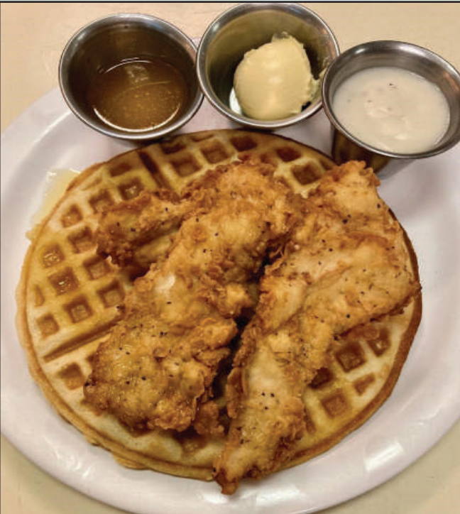
Waffle with hand breaded chicken tenders served with honey butter sauce

3 extra large Eggs cooked any style with choice of Bacon or Spicy Sausage and Hash Browns or Grits, Homemade Biscuit (1) & Gravy or Toast - Substitute Grilled Pork Chop or Ham Special $13.00