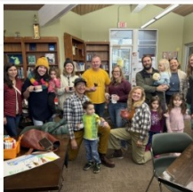
Coffee and donut Mixer (several missed the photo)

"The expert in anything was once a beginner" - Helen Hayes