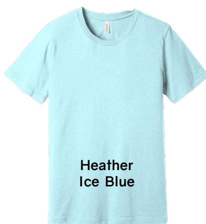
Heather Ice Blue