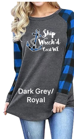
Dark Grey/ Royal