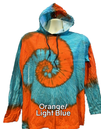
Orange/ Light Blue