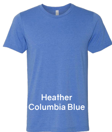
Heather Columbia Blue