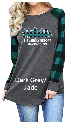
Dark Grey/ Jade