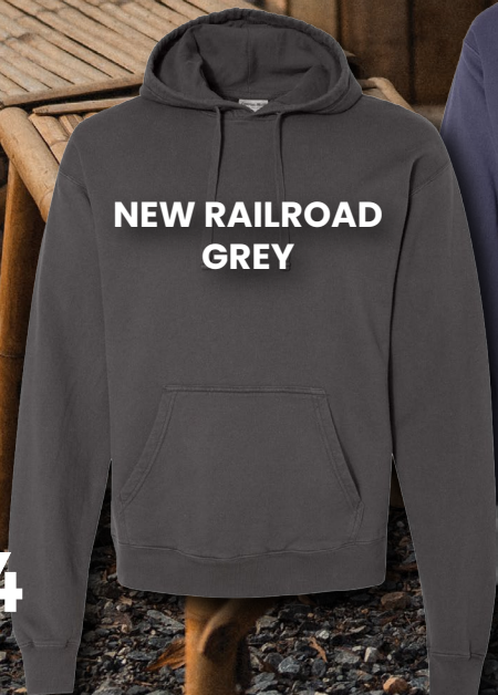
NEW RAILROAD GREY