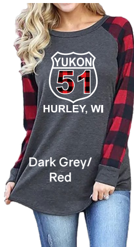
Dark Grey/ Red