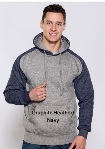
Graphite Heather/ Navy