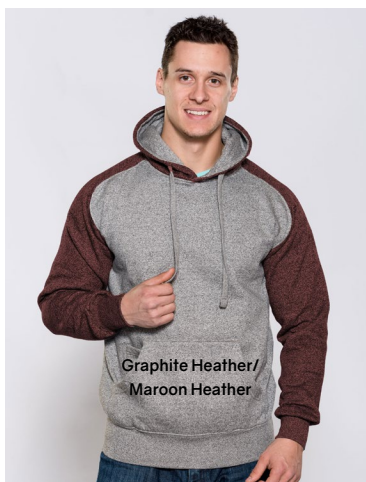
Graphite Heather/ Maroon Heather