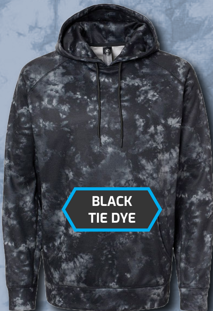
BLACK TIE DYE

SOLD IN PREPACKS BY COLOR: M(4), L(6), XL(4), 2X (2)