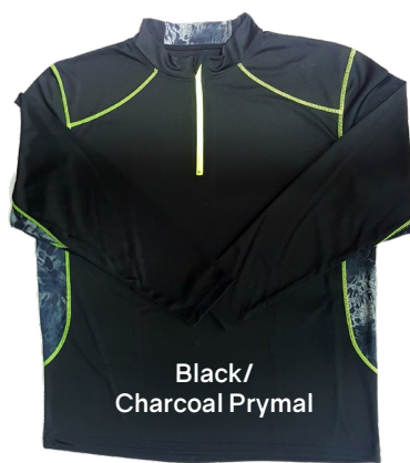
Black/ Charcoal Prymal