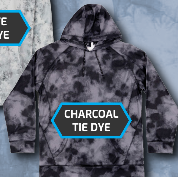
CHARCOAL TIE DYE