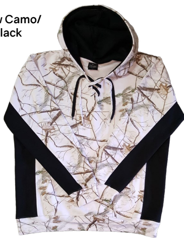
Snow Camo/ Black