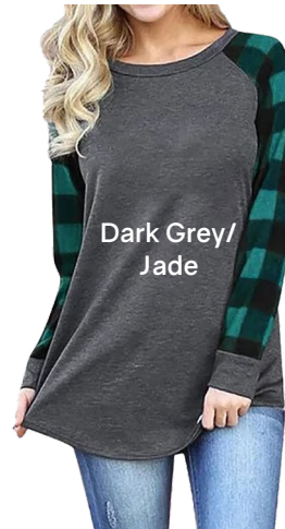
Dark Grey/ Jade