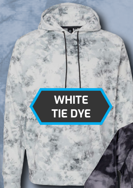
WHITE TIE DYE