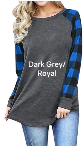
Dark Grey/ Royal