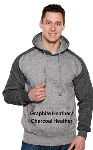
Graphite Heather/ Charcoal Heather