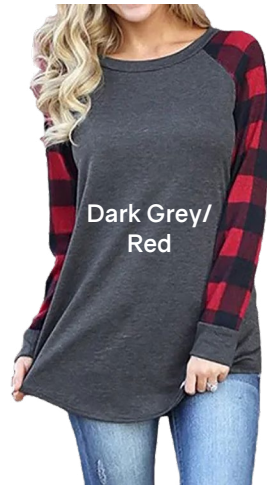
Dark Grey/ Red