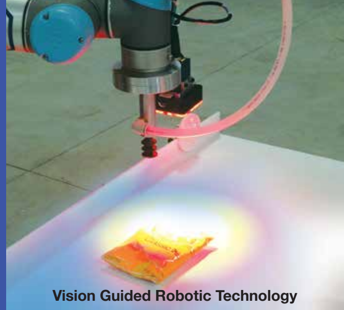
Vision Guided Robotic Technology