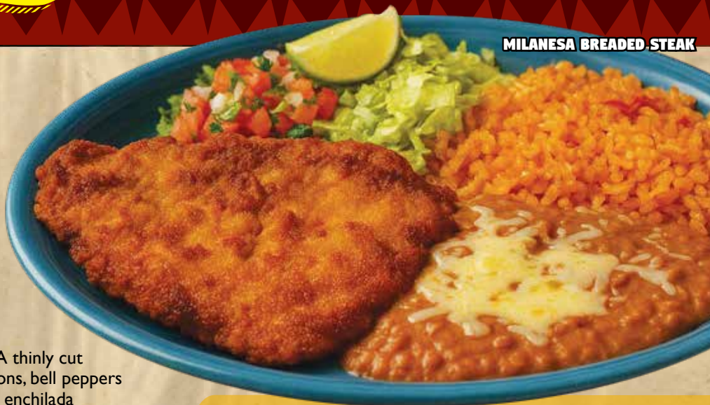
MILANESA BREADED STEAK

*Consuming raw or undercooked meats, poultry, seafood, shellfish or eggs may increase your risk of foodborne illness, especially if you have a medical condition.