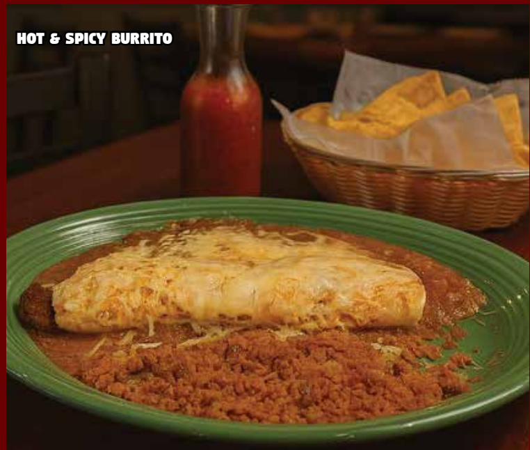
HOT & SPICY BURRITO