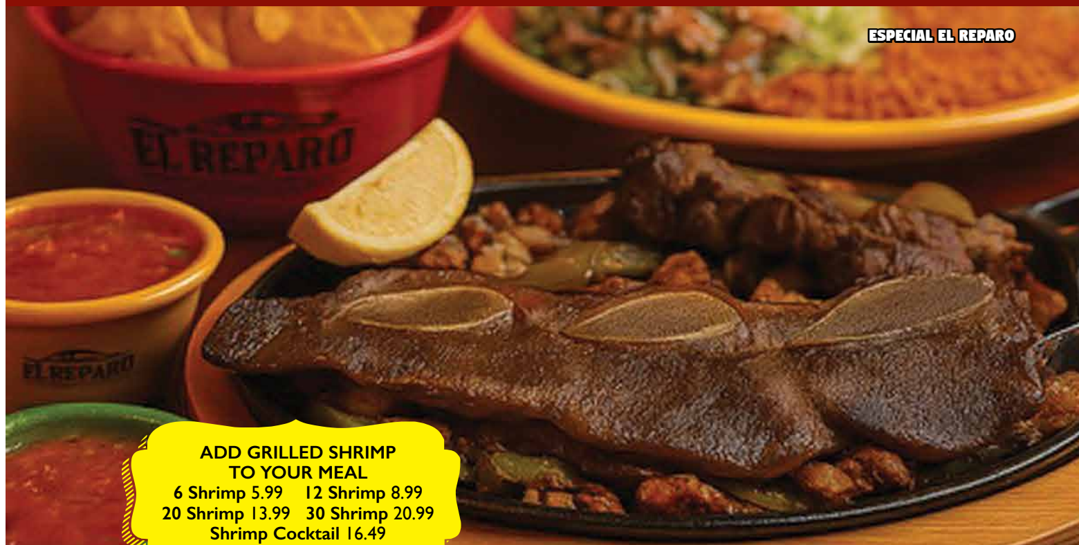
ESPECIAL EL REPARO

- Featuring tender beef, chicken and shrimp FOR ONE 17.99 FOR TWO 31.99