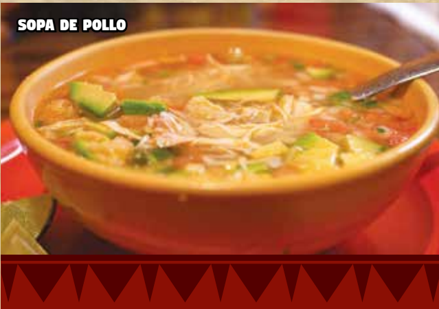
SOPA DE POLLO

SEAFOOD SOUP - Savory broth with shrimp, a tilapia fillet and mixed seafood SMALL 10.99 LARGE 15.99