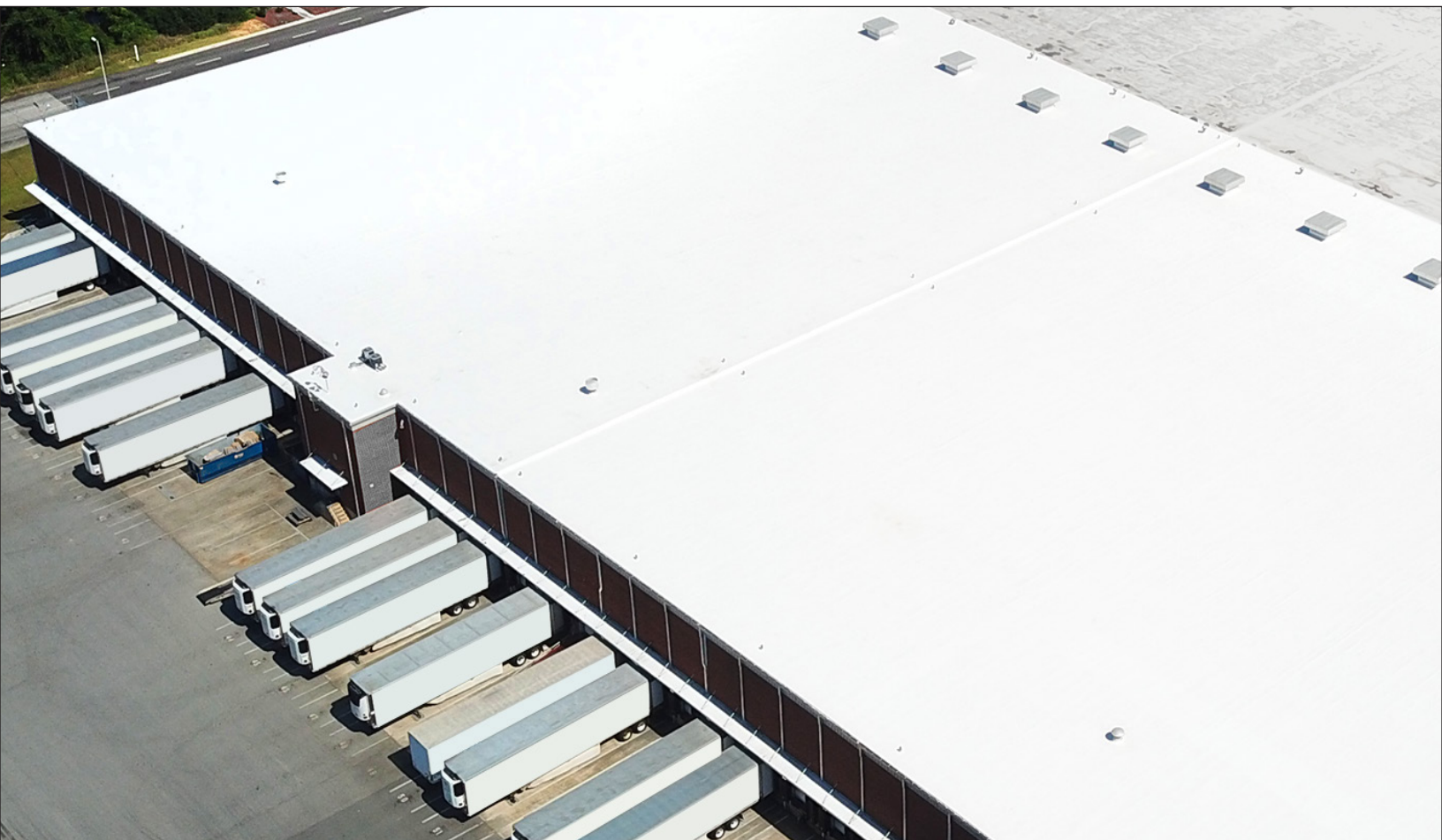
JM/WindSmart Vented Roof System 167,000 sq. ft., JM TPO 60 mil