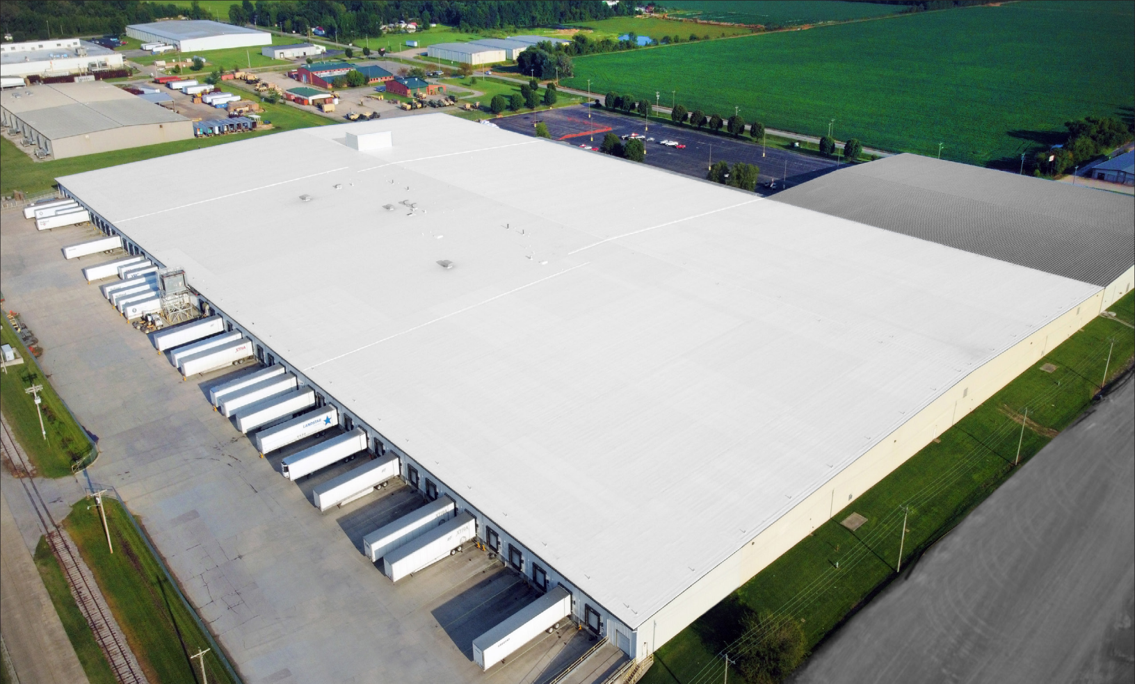
JM/WindSmart Vented Roof System 600,000 sq. ft., JM TPO 60 mil