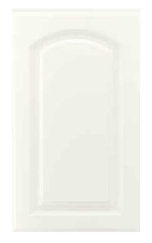
HARBOUR COURT ARCH ① ■ white