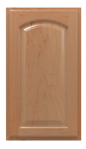
HERITAGE ARCH ™ ®©®⊕ ginger