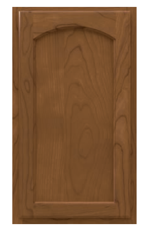
LAUREL ARCH ©© © H chestnut