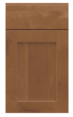
DOVER M M©⊙⊕® terrain