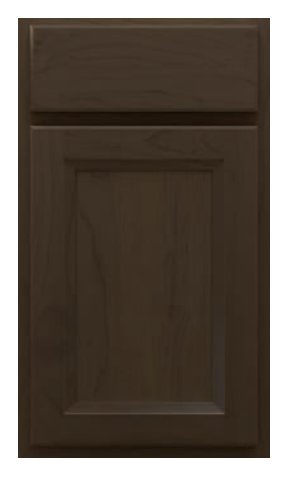
LAUTNER TO MOO HOUSE BUCKBOARD