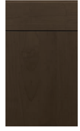
RAINIER M M© buckboard