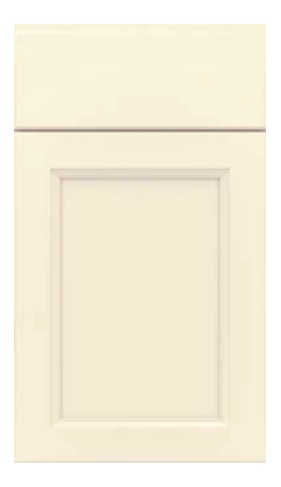
TENNYSON ■ @©⊚ ivory