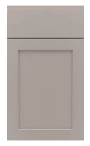
SEDONA M MC⊙H®T willow