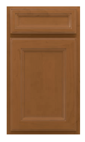
JORDAN 5-PIECE @© nectar