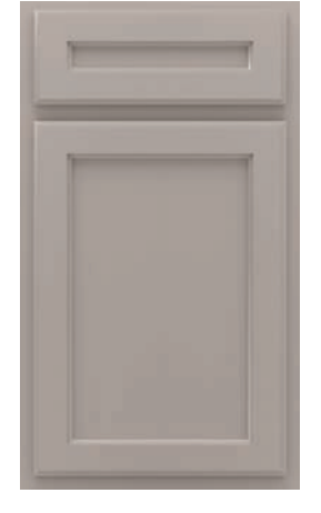
LAUREL 5-PIECE TO MCOM willow