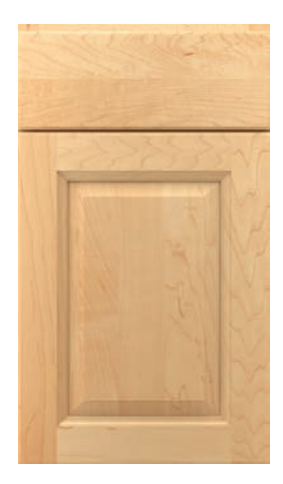
MONTELLA M @©⊚ natural