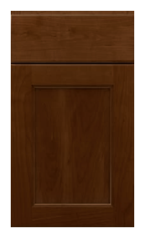
HERSHING ™ @©©® bison