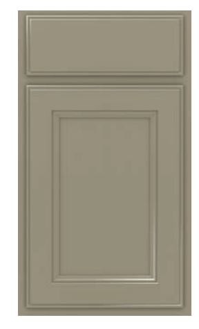
JORDAN I @0 aloe