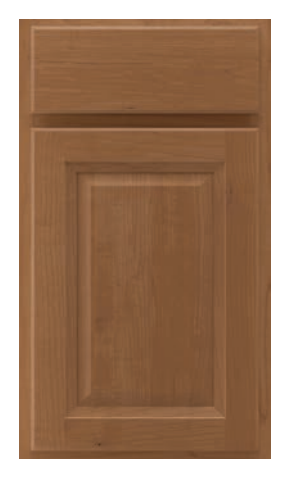
LAWRY TO MOCH terrain