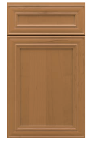
MADISON ™ @© toffee