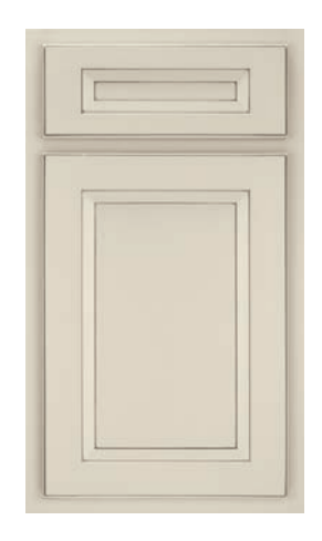
LAUTNER 5-PIECE (M)©(H) sand dollar brownstone