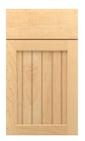
BAYPORT M M©⊕ natural