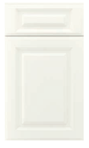
HARBOUR COURT 5-PIECE ① ■ white