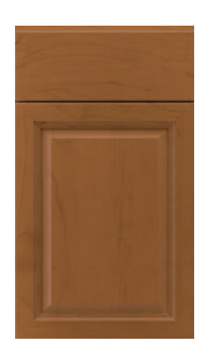
OGILBY ™ @©⊙⊕ nectar