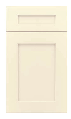
DOVER 5-PIECE M @©⊚⊕® ivory