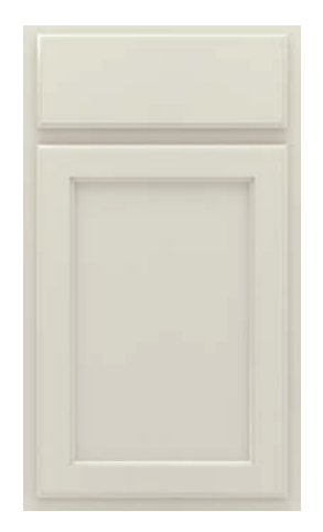
LAUREL TO MOCOO HOS sand dollar