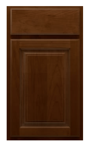
HERITAGE TO MOCOON ROUSE BISON