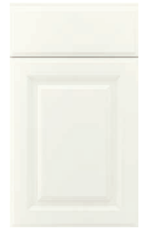
HARBOUR COURT ① white