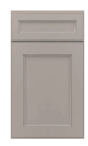
BRENNER ■ @©⊚ willow