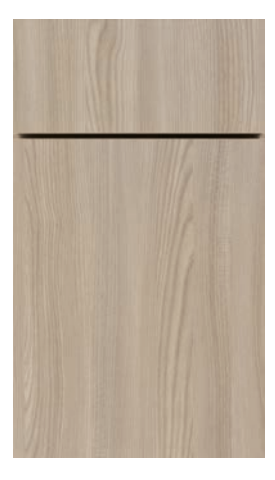
JUNO M (L) tusk