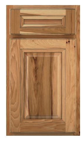
LAWRY 5-PIECE @©® natural brownstone