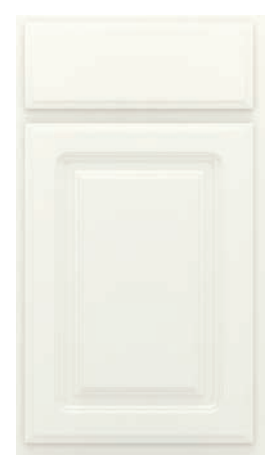
CARA T T white