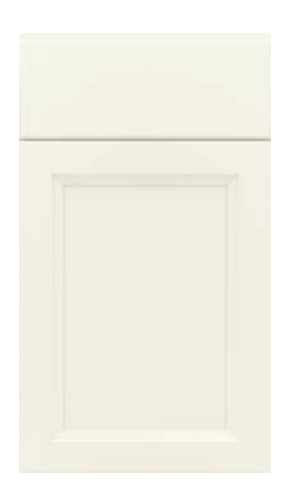
BEXLEY ™ @©⊕ french vanilla