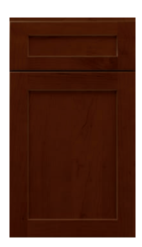
SEDONA 5-PIECE ™ @©⊙⊕®↑ sorrel