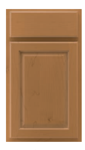
HEARTLAND ■ @©® toffee