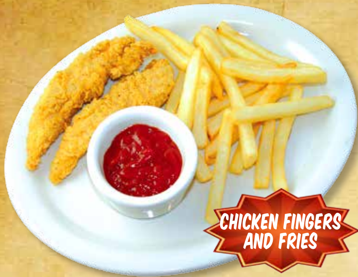
CHICKEN FINGERS AND FRIES