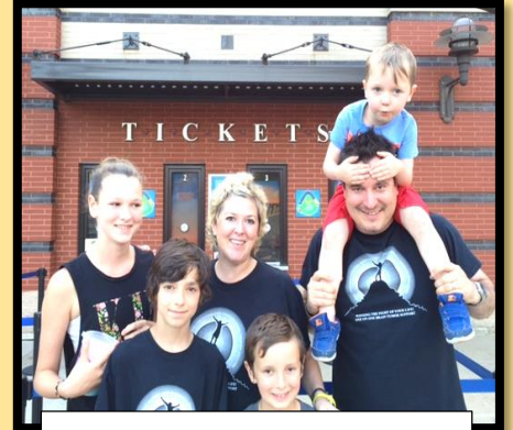
The Cantwells in Akron, Ohio!