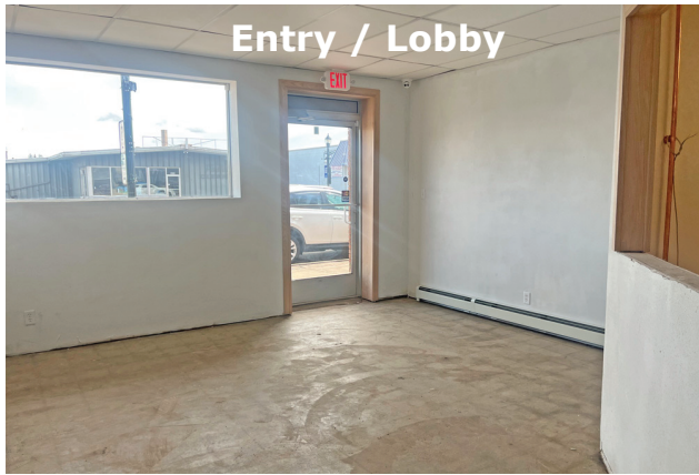
Entry / Lobby