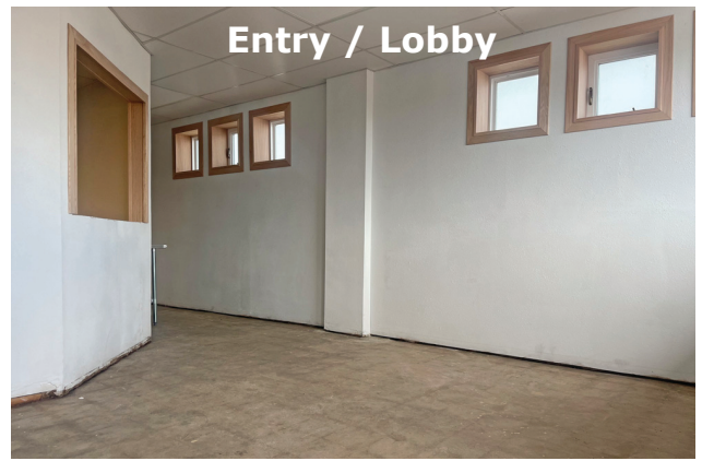
Entry / Lobby