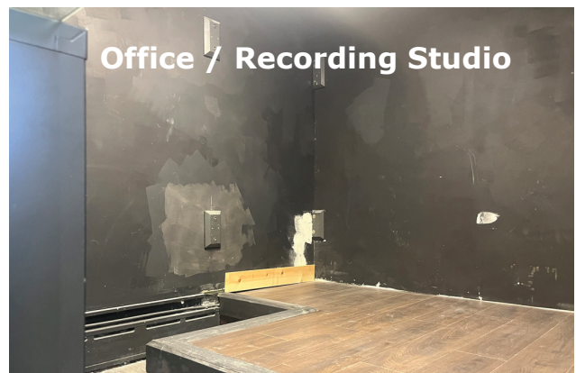
Office / Recording Studio

New Luxury Vinyl Plank Flooring Being Installed throughout the front