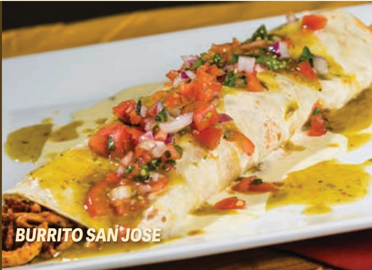
BURRITO SAN JOSE