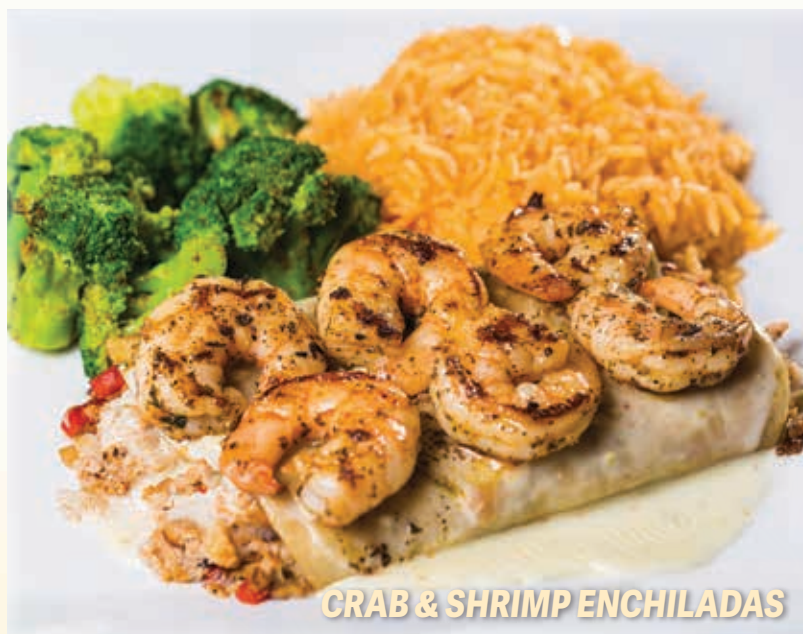
CRAB & SHRIMP ENCHILADAS

Large flour tortilla stuffed with grilled al pastor, pineapple, red onion, rice and beans. Topped with cheese dip and served with lettuce, pico de gallo and sour cream