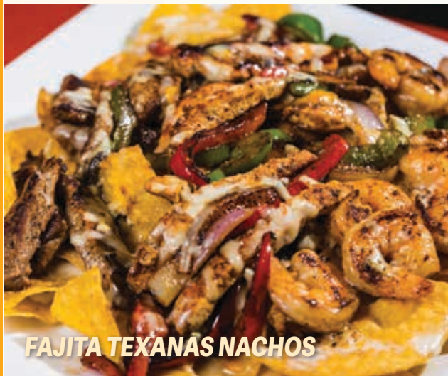
FAJITA TEXANAS NACHOS