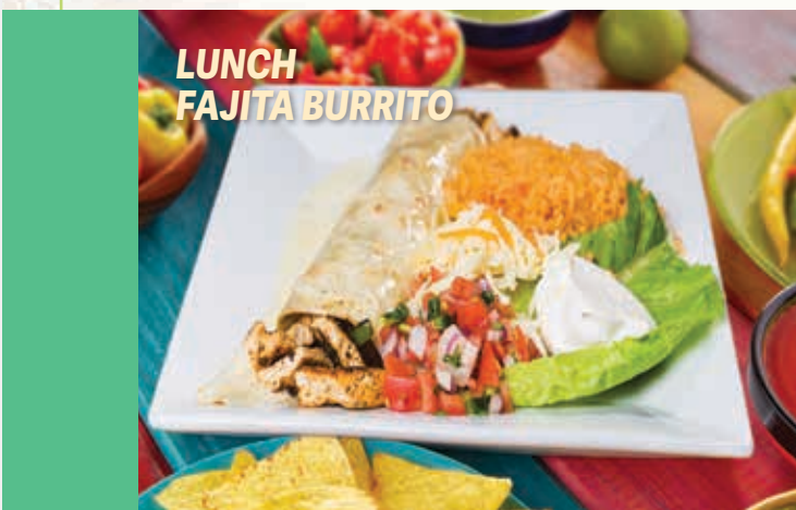
LUNCH FAJITA BURRITO

To our guests with food sensitivities or allergies; We cannot ensure that menu items do not contain ingredients that may cause allergies. Please order with caution.