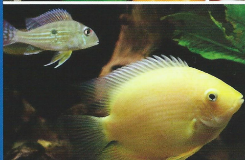
Care for plants and aquariums