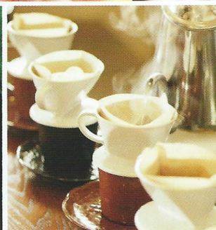
Better tasting beverages