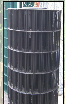
2" x 4" x 48" Green & Black Riverdale vinyl coated wire, 14 ga. Wire before coating