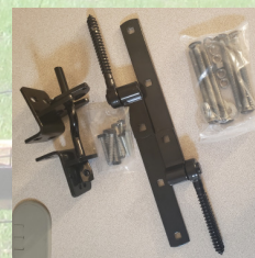
Single Gate Hardware