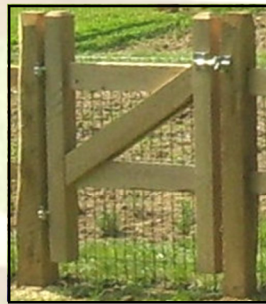
2 Rail Gate w / wire