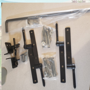
Double Gate Hardware