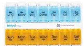
Smart Pill Box