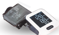
Blood Pressure Monitor