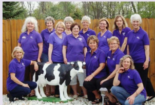
Affectionately called "The Purple Shirts" SEGUES provides as little or as much help as you need, when you need it!